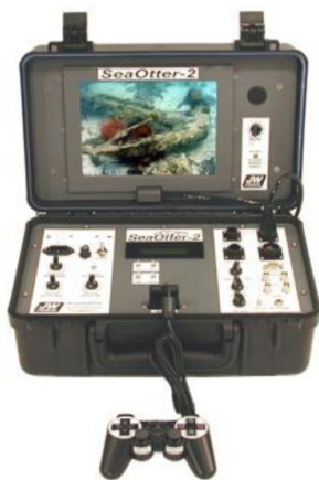
Control box cover with built-in monitor can be removed for custom positioning or mounting

The SeaOtter-2 sends its video picture to a topside 10.4 inch high resolution ultra-bright color monitor which is built into the Control Box cover. A video output in the Control Box allows an additional remote monitor to be used simultaneously. An adjustable video amplifier on the Control Panel allows operator adjustment of the video picture to optimize picture quality for water clarity. A DVR recorder can be connected to the Control Box to make a permanent record. The Control Box also contains an audio amplifier with an input jack on the Control Panel for audio recording.