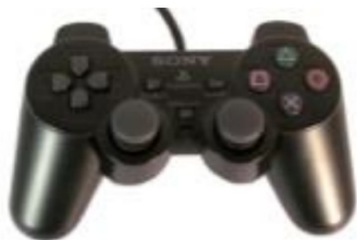
A PS2 Controller's joystick and buttons control the ROV

The ROV has a sophisticated four motor propulsion system; two motors for forward and reverse, and two motors for vertical and lateral thrust. All motors are reversible and operate at variable speeds. An off-the-shelf PS2 controller (supplied) controls the system. A joystick controls the horizontal motors (forward/reverse and turning) - it can hover "in place" and rotate 360 degrees; and the second joystick controls the vertical motors (up/down and lateral movement). A wireless PS2 controller can also be used.