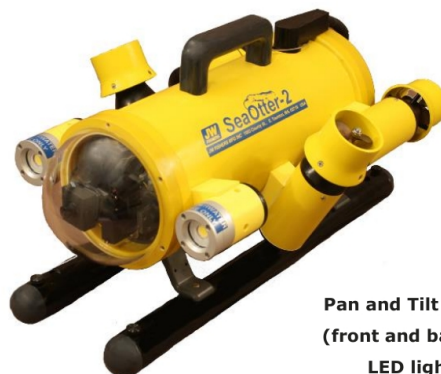
Pan and Tilt Cameras (front and back) with LED lighting

Illumination is provided by two 2200 lumen, high intensity LEDs for the front camera and an "ultra-bright" LED cluster for the rear camera.