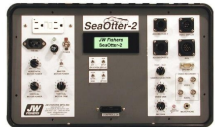
Control Panel's switches, controls and Interface connectors

Illumination is provided by two 2200 lumen, high intensity LEDs for the front camera and an "ultra-bright" LED cluster for the rear camera.