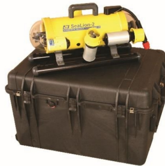
ROV Carry Case included with system

The Control Panel also contains a LCD readout which displays the overall status of the system.